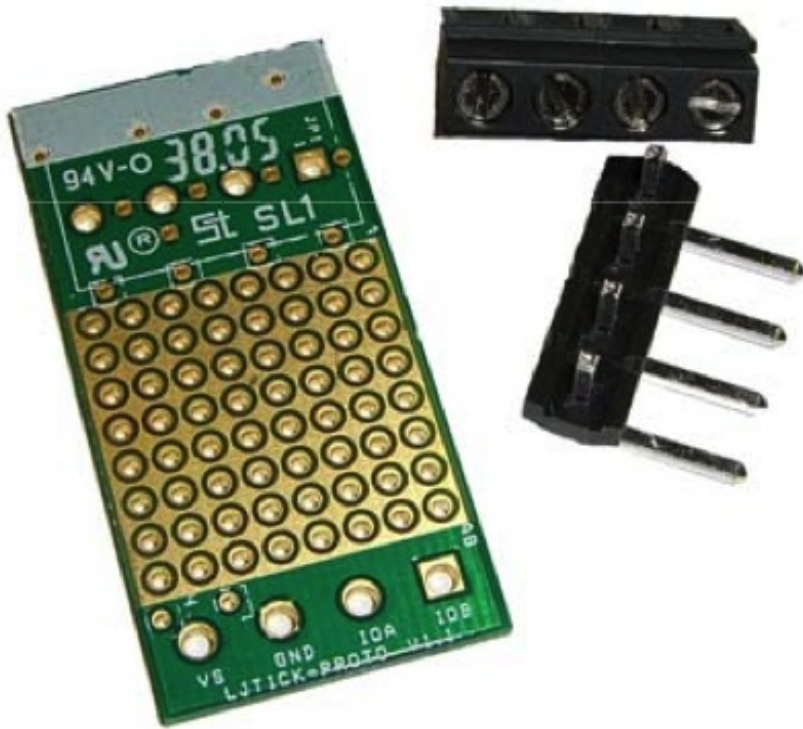
Figure 1: LJTICK-Proto (LJTP)

Besides the exceptions that follow, the LJTP consists of various unconnected holes. The user must provide the desired connections.